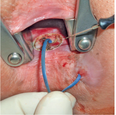
Figure 2 Left: preoperative situation with seton in place. Right: circumferential excision of anoderm around the internal fistula opening, of about 2 cm in diameter.