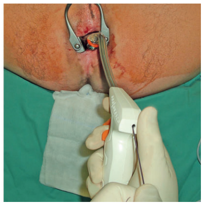
Figure 4 Left: the sutures are tied at their distal end and pulled through the working channel of the clip applicator using the thread retriever. Right: advancement of the clip applicator over the sutures towards the internal fistula opening.