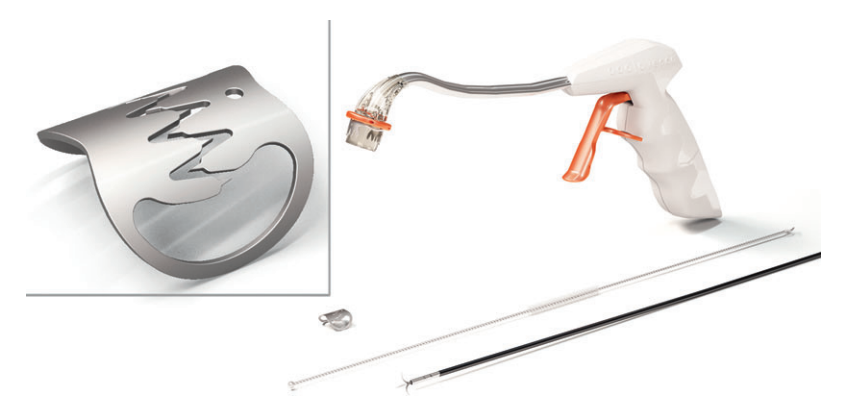
Figure 1 The clip of the OTSC Proctology is 14 mm in diameter and is made of a super-elastic shape memory alloy (Nitinol). The OTSC Proctology system consists of the clip and the clip applicator. A special fistula brush and an anchor device are accessories of the OTSC Proctology.

original (closed) shape after release from the applicator. If applied on the internal fistula opening, the clip exerts constant compression on the tissue between the jaws of the clip and therefore closes the internal fistula opening.